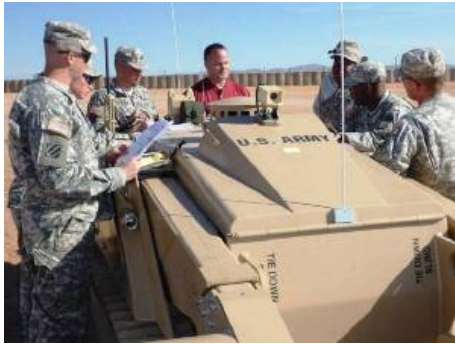
Tripping improvised explosive devices and unexploded ordnance in a controlled way to avoid Soldier injury has become an automated process now for Soldiers here and at Fort Bliss, Texas.

Soldiers are now training on the M160 MV4 DO-KING, a remote-controlled, tracked mine clearance system to trip hidden IEDs, UXOs and anti-personnel mines. By sending the system out to look for explosive dangers, Soldiers can clear a route without putting themselves in danger.