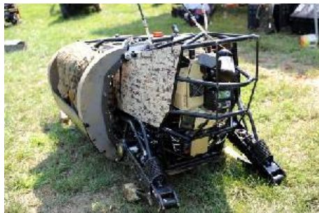
Two completed prototype robotic “pack mules” exhibit reduced noise, new gaits, and improved perception

DARPA's Legged Squad Support System (LS3) program demonstrated two robotic “pack mule” prototypes for the Commandant of the Marine Corps, Gen. James F. Amos, and DARPA Director, Arati Prabhakar. The first platform underwent its initial outdoor test earlier this year and has matured through continual testing and improvements to the point that two functioning platforms have started to run through the paces similar to what they could one day experience carrying gear for a squad of Marines or Soldiers. The goal of the LS3 program is to demonstrate that a legged robot can unburden dismounted squad members by carrying their gear, autonomously following them through rugged terrain, and interpreting verbal and visual commands.