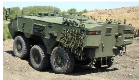
Otokar, the leading land system manufacturer of the Turkish Defence Industry, is to exhibit its 4x4 and 6x6 armoured vehicles at Eurosatory.