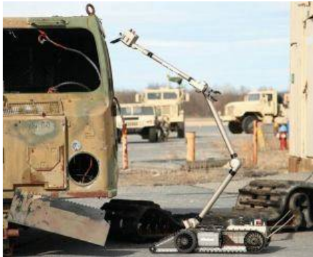
iRobot Corp., a leader in delivering robotic technology-based solutions, has received two orders from the U.S. Army's Robotic Systems Joint Program Office (RSJPO) totaling $6 million.

The orders call for the delivery of spares for iRobot 510 PackBot robots, including operator control units, manipulator arms and radios. All deliveries will be completed by November 30, 2012.