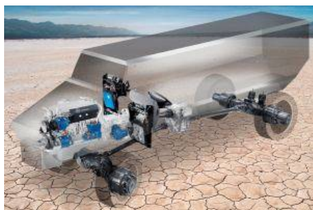
Mercedes-Benz Special Chassis, business unit of Mercedes-Benz, will release new FGA Component Kit and FGA 14.5 Special Chassis at Eurosatory 2012 (11 - 15 June 2012).