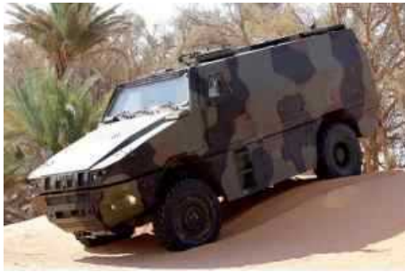
Rome -- Iveco Defence Vehicles announces that on December 20th, 2010 the Italian Army placed order for a batch of 12 MPV in the Ambulance version (named VTMM Ambulance by the Italian Army) to be delivered between 2011 and 2012.

The Ambulance version of the MPV-VTMM has been developed on the basis of the MPV 4x4 platform increasing the volumes and ergonomics. The vehicle is equipped with two stretchers and will transport a crew of 4 people: driver, commander, medical officer, nurse. A suitable system for loading stretchers has been developed. The vehicle will be equipped with NBC protection system.