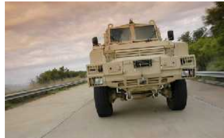
LONDON, Ontario -- The U.S. Marine Corps Systems Command awarded General Dynamics Land Systems-Canada a USD$317.4 million delivery-order modification for upgrade kits for RG-31 Mk5E vehicles previously delivered under the Mine Resistant Ambush Protected (MRAP) vehicle program.

General Dynamics Land Systems, the Canadian company's parent corporation, is a business unit of General Dynamics.