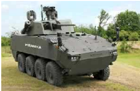
The latest member of the PIRANHA family of armoured wheeled vehicles, the PIRANHA 5, will be displayed in a Desert Piranha configuration with the Kongsberg .50 cal. Remote Control Weapon Station.

This advanced new vehicle will raise the benchmark in the areas of survivability, mobility and firepower, marking unprecedented progress in the development of armoured wheeled vehicles. PIRANHA 5 provides the highest levels of survivability against conventional and asymmetric threats, while having the capacity to fill all battlefield roles such as APC, Electronic Warfare, Ambulance, Reconnaissance, Command, Mortar and even Direct Fire with turrets up to 120 mm calibre. The vehicle on display at IDEX is an example of what can be achieved with PIRANHA 5, an APC with an internal seating capacity for eleven soldiers. The PIRANHA 5 can be supplied in either high or low roof configurations with open architecture, over 15 tons of payload and 120 kW electrical power. The vehicle is equipped with numerous other sub-systems that enhance performance and flexibility such as the digital CAN backbone; fuel efficient drivetrain technology; integrated heating, air-conditioning and NBC protection systems; and the