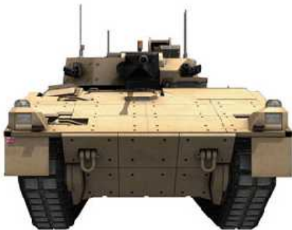
LONDON -- Lockheed Martin UK has been awarded

Lockheed Martin has already been working on the project, thanks to advance funding provided by the MoD through General Dynamics UK as prime contractor, ahead of full contract agreement, to ensure the Demonstration Phase schedule remained fully on track. As part of this contract, Lockheed Martin UK - Ampthill will provide General Dynamics UK with three Scout turrets which will form part of the Integration and Test programme on the Demonstration Phase of the Scout project.