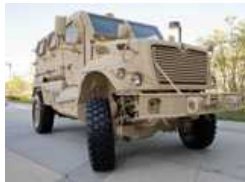
WARRENVILLE, Ill. -- Navistar Defense, LLC today announced that it received a $123 million delivery order for an additional 175 International® MaxxPro® Dash vehicles with DXM™ independent suspension.

The order from the U.S. Marine Corps Systems Command also includes parts for the company's Mine Resistant Ambush Protected (MRAP) vehicles.