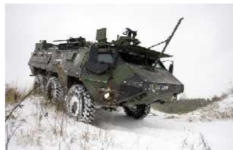
The Estonian Defence Forces presented the Sisu XA-188 new armored cars in Mõnniku practice field.

Estonia is buying 81 new armored cars from the Netherlands and they should gradually reach the members of the Defence Forces of Estonia by the year 2015.