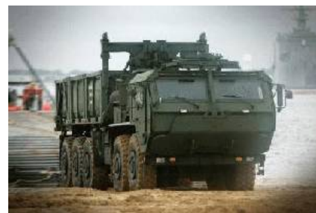
OSHKOSH, Wis. -- Oshkosh Defense, a division of Oshkosh Corporation, will supply the U.S. Marine Corps with more than 100 Logistics Vehicle System Replacement (LVSRC) Cargo Variants and 120 enhanced protection kits following an order from the Marine Corps Systems Command (MARCORSYSCOM).