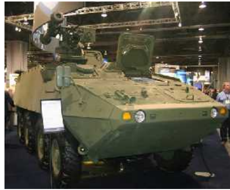
TUCSON, Ariz. -- The Raytheon - Lockheed Martin Javelin Joint Venture reached a major milestone with the first Javelin missile firings from a Common Remote Operations Weapon Station II.

The station was mounted on a Stryker Infantry Fighting Vehicle (IFV) in a near-tactical configuration. Three missiles impacted their targets at 500 and 1,000 meters (1,640 and 3,280 feet) downrange, confirming the successful integration of the Javelin into the CROWS II. The Javelin vehicle launch box, fire control unit and remote weapon system communicated effectively, resulting in an optimal firing of the missiles.