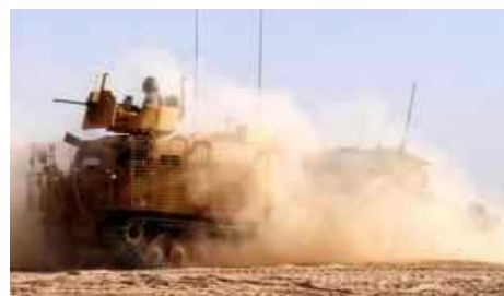
Soldiers or 'Tankies' from the 2nd Royal Tank

The TIM1500™ thermal imagers used on remote weapon stations allow soldiers to detect and identify enemy targets while remaining protected inside their vehicles through remotely controlled, vehicle-mounted platforms for light- and medium-caliber weapons. The TIM1500 provides extended viewing range capability to detect vehicle targets at a significant range for target acquisition, long-rang surveillance, and situational awareness.