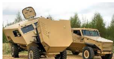
Ladson -- Force Protection Australasia, a Force