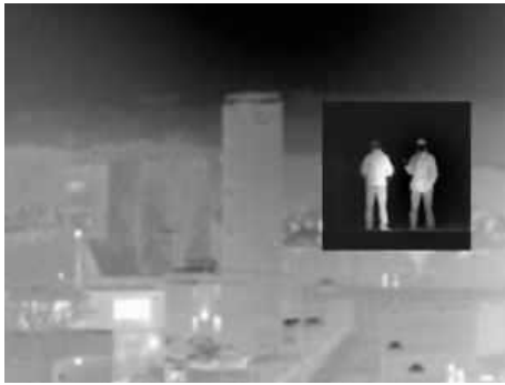
Porton Down -- On the 26 May, SELEX Galileo, a Finmeccanica Company, played a key part in the UK Ministry of Defence (MoD)'s trials being carried out under the Electro-Magnetic Remote Sensing (EMRS) Defence Technology Centre (DTC).

Since the start of the DTC initiative in 2003, SELEX Galileo has led the EMRS DTC consortium's efforts to manage this J42M collaborative research programme, a key building block in the UK's military sensing research programme.