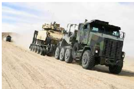
OSHKOSH, Wis. -- Oshkosh Defense, a division of Oshkosh Corporation, has received a contract with the U.S. Army Tank-automotive and Armaments Command Life Cycle Management Command (TACOM LCMC) to supply more than 40 new M1070 Heavy Equipment Transporters (HET) and 635NL trailers to Egypt.

The Oshkosh® HET is designed to rapidly transport M1A1 Main Battle Tanks, armored vehicles and self-propelled guns, as well as a six-person crew, so the vehicles and soldiers arrive in mission-ready condition.