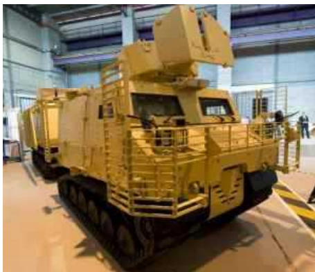
The first of 100 new Warthog vehicles, bought by the MOD to be used by British troops in Afghanistan's Green Zone, arrived in the UK yesterday to be prepared for operations.

Powered by a 7.2-litre engine that produces 350 brake horse power, the Warthog can wade through water while carrying up to 12 troops and offers improved levels of protection.