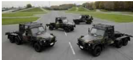
Graz, Austria/Melbourne -- Germany’s Mercedes-Benz delivered on Oct. 29th 2009 the first of 1,200 specially made G - Class offroad vehicles to the Australian Army.

The new purpose-built cross-country vehicles will replace the Australian Defence Force’s (ADF) existing tactical vehicle fleet. Their entry into the Australia’s military is the result of a large-scale project by the ADF, internally coded as ‘Land 121’ but more commonly referred to as ‘Project Overlander’.