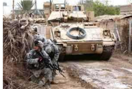
ARLINGTON, Va. -- The U.S. Army has awarded BAE Systems a contract for $601 million to refurbish some of its heavy infantry vehicles.