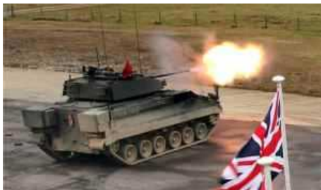
LEICESTER, United Kingdom -- British Army Warrior infantry fighting vehicles are set for a major boost in combat effectiveness by 2013 if a BAE Systems bid to upgrade the fleet is successful.

The bid, submitted a day before the 18 Nov deadline, is for the J1bn Warrior Capability Sustainment Programme (WCSP), which will provide the mainstay of the Infantry's frontline fleet in Afghanistan and future conflicts. It features a new turret and weapon system to increase firepower; a fully digital 'operating system' to improve fightability and survivability, and allow plug-and-play future upgrades; and a modular armour system for quick and simple adjustments to protect against ever-changing threats.