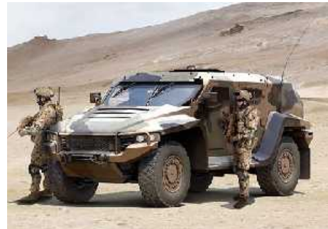
Thales Australia's innovative Hawkei vehicle is starring at this week's Armoured Vehicles Australia event in Canberra.

Hawkei is Thales's contender for the Department of Defence's LAND 121 Phase 4 program to replace Army Landrovers. The sleek 7-tonne 4x4 can carry up to six soldiers, and incorporates high levels of blast and ballistic protection.