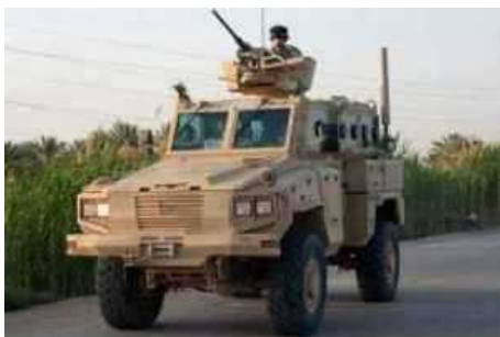
CAPE TOWN, South Africa -- BAE Systems has launched the newest version of its acclaimed RG series of mine resistant personnel carrier vehicle, the RG31 Mk6E, which will make its debut at the African Aerospace & Defence 2008 show in Cape Town (17-21 September).

Since receiving a Canadian armed forces order for RG31 Mk3 vehicles in 2003, the Benoni-based company's RG-series of products have boosted South African exports by more than ZAR3.5 billion ($430 million) with a steadily increasing series of additional orders for vehicles, spares and support from new customers around the globe. It has also created over 300 new jobs at its factory near Johannesburg and many more throughout its supplier network.