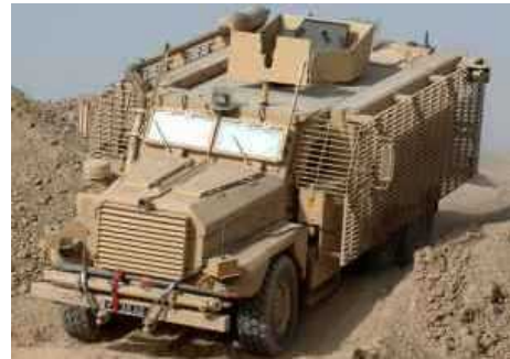
A J60million contract to deliver the new generation of Mastiff vehicles - the Mastiff 2 - has been announced by UK Defence Secretary Des Browne on a visit to NP Aerospace.