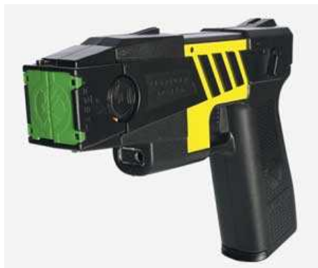
SCOTTSDALE, Ariz. -- TASER International, Inc., a market leader in advanced electronic control devices, released the following News Alert:

According to an article in the December 27, 2007 edition of the Edmonton Sun, Edmonton police are crediting the use of a TASER(r) device for avoiding tragedy after a knife-wielding fugitive ran into a crowded toy store on Wednesday.