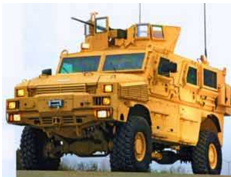
The Department of Defense today announced a