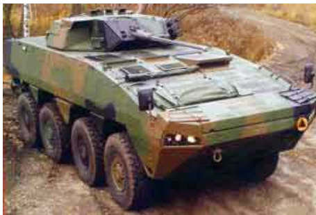
Half a year ahead of schedule, the first Slovenian configuration Patria AMV 8x8 APC vehicle was delivered to the customer today.

The vehicle was manufactured in Finland where also the Slovenian partners have been trained. After extensive end user tests starting as of now, the vehicle will be additionally customised at the Gorenje INDOP facilities in Sostanj, and will be ready for final hand-over later next spring.