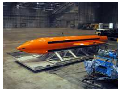
A bomb is an explosive device that generates and releases its energy very rapidly.

The explosion creates a violent, very destructive shock wave. Bombs cause destruction and injury to objects and living things within the blast radius by the crushing