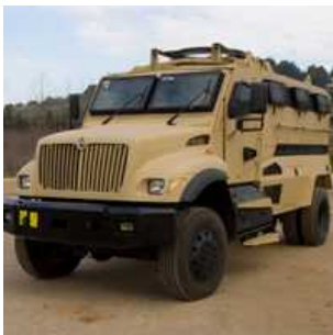
Largest Single Order to Date of 1,500 MaxxPro MRAP Vehicles; Navistar Captures Nearly 50 Percent of Military's Orders.

Making its largest single order to date of Mine Resistant Ambush Protected (MRAP) vehicles, the U.S. Marine Corps today ordered 1,500 additional MRAP vehicles valued at nearly $1.2 billion from International