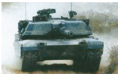
The U.S. Army Tank-Automotive and Armaments Command on May 4 awarded General Dynamics