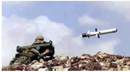
General Dynamics Santa Barbara Sistemas was awarded a $424.5 million contract in late December 2006 by the Spanish Army for the supply of Long Range (LR) SPIKE Missile Systems.

General Dynamics Santa Barbara Sistemas is one of four companies that comprise General Dynamics European Land Combat Systems, a business unit of General Dynamics.