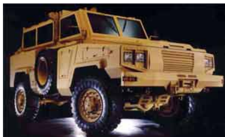
The U.S. Army Tank Automotive and Armaments Command (TACOM), in support of the Program