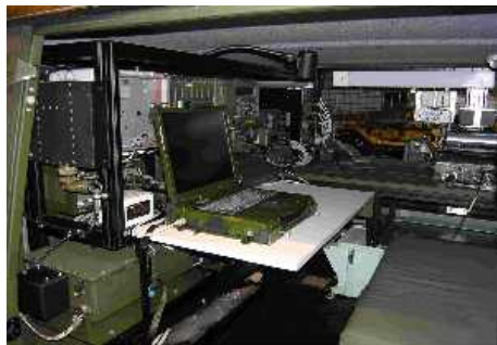
Representatives of the Federal Office for Information Management and Information Technology of the Federal Armed Forces (IT-AmtBw) and the joint-venture FuInfoSys Heer (Krauss-Maffei Wegmann and Rheinmetall Landsysteme) signed the amended contract for the serial procurement of the Army's command and control information system.

After the successful conclusion of service tests, some 1500 vehicles will be equipped with the first production batch of the system by the year 2012. The contract also