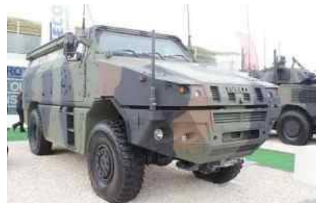
Iveco Defence Vehicles, a company of CNH Industrial N.V., announced today that it has been awarded a contract by the Dutch Ministry of Defence to provide 1275 medium multirole protected vehicles denominated “12kN”.