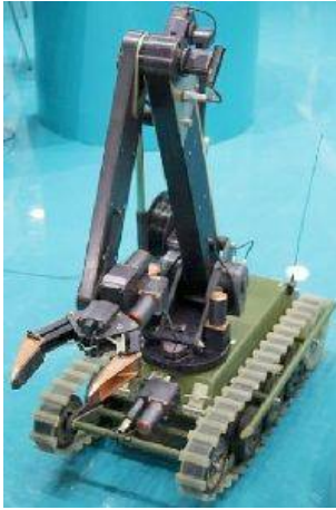
Remote controlled Cobra-1600 Explosive Ordnance Disposal Unmanned Ground Vehicle (EOD UGV), for the first time entered service brigade of the Russian army.

Cobra-1600 EOD UGV is used for visual reconnaissance, search and primary diagnosis of suspicious objects with cameras, and special attachments. For the evacuation of neutralized explosive devices, the UGV is equipped with special containers. Also, the robot is used in performing technological operations to provide access to potentially dangerous objects.