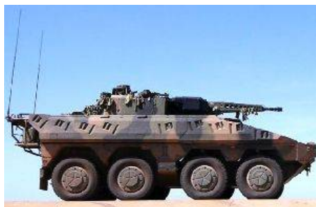
Australia has awarded Rheinmetall an order for 211 Boxer wheeled armoured vehicles worth a total of €2.1 billion (AUD3.3 billion).

The contract was signed at Parliament House in Canberra today by the Prime Minister of Australia Malcolm Turnbull and the Managing Director of Rheinmetall Defence Australia Gary Stewart. Delivery of the advanced 8x8 Combat Reconnaissance Vehicles (CRV) will take place between 2019 and 2026.