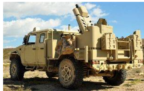
EXPAL, a benchmark in the design and manufacture of technologies and solutions in mortar systems, showcased the latest functions of the EIMOS system at its stand, which can be visited at Eurosatory 2018 until 15th June.