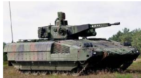
The 200th Puma infantry fighting vehicle earmarked for the Bundeswehr has just rolled off the assembly line at the Rheinmetall plant in Untermaßfeld in Lower Saxony. It is also the 100th Puma manufactured by the Düsseldorf-based tech enterprise, part-owner of the joint venture tasked with producing the vehicle. The jubilee vehicle will soon be arriving at the Bundeswehr's force integration organization in Munster a.d. Urtze, likewise located in Lower Saxony.

The Puma IFV is the raison d'être of Projekt System & Management (PSM) GmbH, the fifty-fifty joint venture of Rheinmetall and Krauss-Maffei Wegmann in charge of developing and producing the vehicle as well as providing subsequent in-service support. (Each of the two partners is responsible for manufacturing half of the vehicles on order.) Just attained, this milestone shows that production of the Puma is in full swing and proceeding according to plan. The state-of-the-art infantry fighting vehicle is currently being integrated into the force structure of the German Army. Delivery of all 342 combat vehicles, which commenced in 2015, is scheduled for completion in 2020. In addition to the IFVs, the Bundeswehr has also taken delivery of eight driver training vehicles.