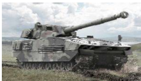
Otokar, the leading supplier of Turkish Land Forces, debuted its TULPAR Light Tank at Eurosatory 2018 in Paris, France.

Otokar, a Koç Group company, debuted its TULPAR Light Tank for the first time at Eurosatory 2018, Europe’s largest defense industry exhibition in Paris, France between June 11th and 15th. Within its wide product range Otokar will also display its ARMA,