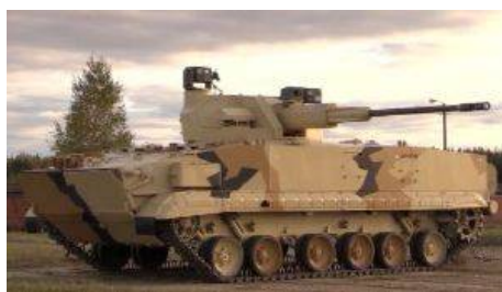
Uralvagonzavod Corporation (UVZ, part of Rostech) has published video of combat shooting at the range from a gun of the caliber of 57 mm, mounted on the weapon station of BMP-3 IFV. The weapon station can be remotely controlled from a position outside the vehicle.

As explained in the corporation, 57-mm AU-220M weapon station, created by the Burevestnik Central Research Institute (included in the UVZ), can be remotely controlled. "Its newest gun not only has increased accuracy of shooting and armor penetration, but it can be controlled remotely," the corporation noted.