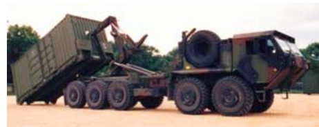
OSHKOSH, Wis., -- Oshkosh Truck Corporation announced that it has unveiled an unmanned version of its Palletized Load System (PLS) vehicle at the U.S. Army Tactical Wheeled Vehicle Component Technology Demonstrations in Yuma, Ariz. Showcasing the immediate application of the technology for the U.S. Army fleet, Oshkosh is demonstrating a real-world mission scenario as the driverless truck transports cargo between destinations seven miles apart in the Arizona desert.

The unmanned navigational kit being applied to the PLS was tested at the 2004 and 2005 DARPA Grand Challenge races, and has undergone additional testing in desert environments, similar to those in the Middle East. Oshkosh is partnered with Rockwell Collins and the University of Parma, Italy, on the development this unmanned navigational kit.