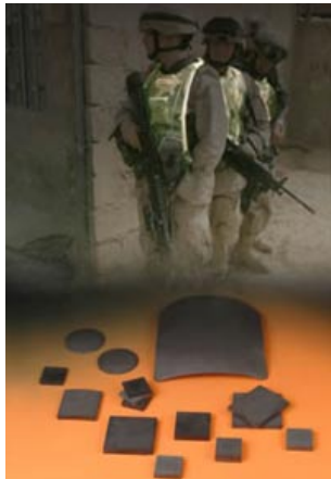
Haifa, -- RAFAEL Armament Development Authority Ltd. has received an order valued at $2.2M for ultra lightweight personal ceramic armor intended to protect the individual soldier on the modern battlefield.

Developed by RAFAEL, this unique armor is made of boron carbide, one of the hardest materials known and has the ability to defend against high velocity projectiles at a lower cost than that of its competitors.