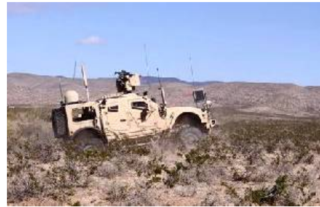
General Dynamics received the first full rate production order from the U.S. Army to build additional Warfighter Information Network – Tactical (WIN-T) Increment 2 systems.

The $219 million order includes the production of more than 300 vehicle-based network communication nodes along with related equipment and materials. WIN-T Increment 2 is the Army's communications backbone providing secure, on-the-move communications, mission command and situational awareness for commanders and their soldiers. The order allows the Army to continue fielding WIN-T Increment 2 to Army units currently scheduled to receive the system.