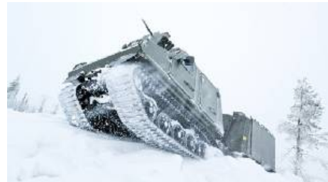
Rheinmetall Canada Inc will display the BAE Systems BvS10 all-terrain vehicle on its outdoor stand (#2102) at the CANSEC defense exhibition in Ottawa from May 28 through May 29.

The move follows a teaming agreement signed by the two companies in late 2013 as part of a future bid for the Marginal Terrain Vehicles (MTV) program in Canada, offering the BvS10.