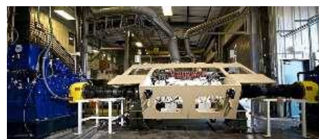
BAE Systems' Ground Combat Vehicle (GCV) Hybrid Electric Drive (HED) system successfully completed