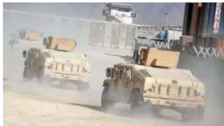
A historic mission for the 401st Army Field Support Brigade came to an end, Nov. 12, when AFSBn-Bagram issued 49 M1114 vehicles to the Afghan National Army, under a Foreign Military Sales case.

The 49 vehicles were the last of more than 950 vehicles that were involved in the program that lasted about two and one-half years. Before the vehicles were turned over to the ANA, they were completely checked and restored to a fully mission capable status at AFSBn-Bagram and Camp Lindsey near Kandahar. In some cases, the vehicle was practically rebuilt from the ground up, while other vehicles required only minor repair and refurbishment.